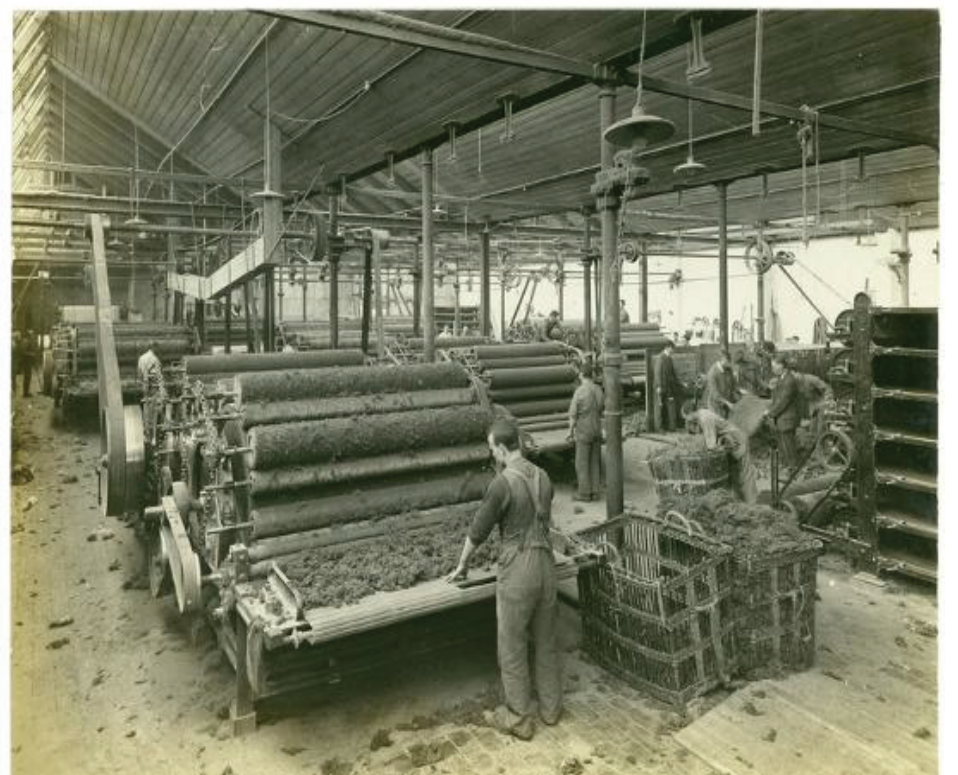
1920's Carding Room

TATHAMS is an old manufacturer of Carders, this one dates back to the 1950's and would have been part of a set in a Mill. Unguarded, this type of machine was the cause of many severe injuries.